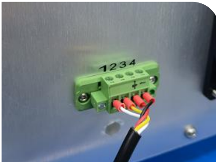
Light Shield Box