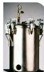
Pail Drop-In Reservoir