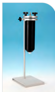
20 oz (550 mL)