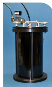
Bottle Drop-In Reservoir