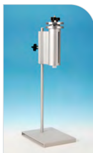
6 oz (160 mL)