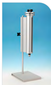
12 oz (300 mL)