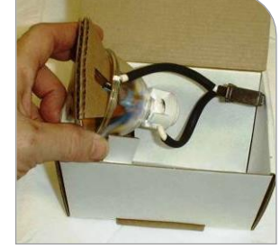
Figure 7. Remove Bulb from Box