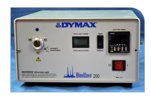
Figure 1. BlueWave 200