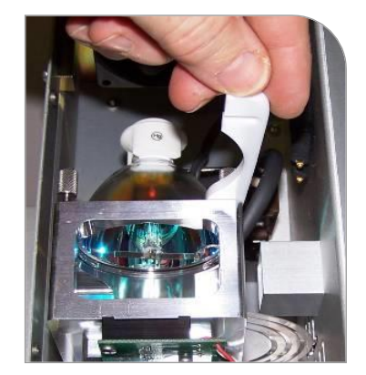
Figure 3. Lift Bulb Mounting Bracket