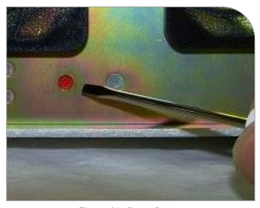
Figure 25. Reset Button