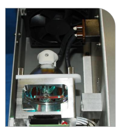
Figure 2. Bulb Installed in Bulb Mount