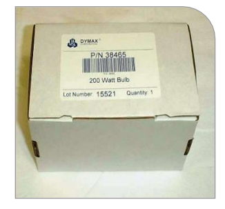
Figure 5. Bulb Package (Closed)

4. Unpack the new Bulb. Take care not to bend the flat Electrode in the center of the Bulb.