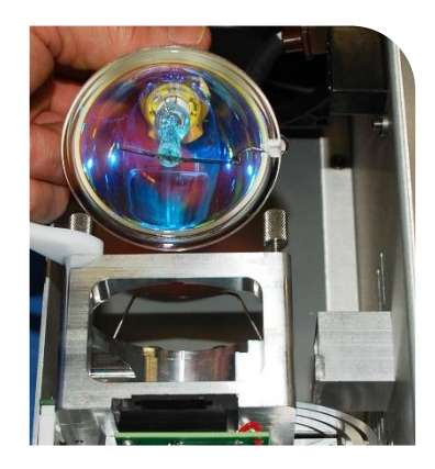
Figure 4. Remove Bulb from Bulb Mount

4. Unpack the new Bulb. Take care not to bend the flat Electrode in the center of the Bulb.