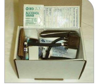
Figure 6. Bulb Package (Open)