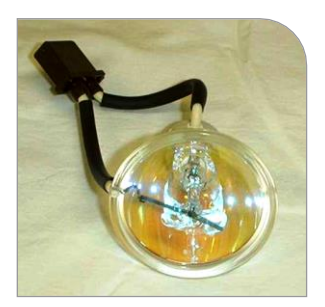
Figure 8. Bulb