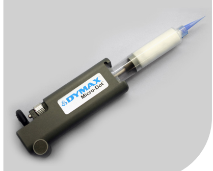
Thumb Activated Micro-Dot Syringe Dispenser (T20000)