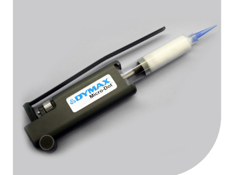
Lever Activated Micro-Dot Syringe Dispenser (T20010)

The Micro-Dot<sup>™</sup> portable syringe dispenser offers positive-displacement accuracy for dispense volumes as small as 0.0003 mL. Once a volume is set it can be repeated with accuracy. This syringe dispenser utilizes a prepackaged disposable syringe as its fluid reservoir, preventing any contact between the fluids and the dispenser eliminating fluid contamination during dispense. With the proper dispense tip selection, the Micro-Dot is suitable for dispensing a wide range of low-to-high viscosity fluids including pastes, lubricants, adhesives, sealants, and more.