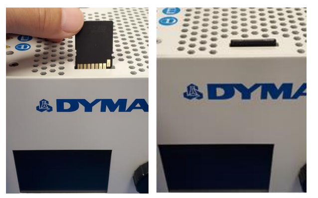
Figure 1. Insert the SD Card