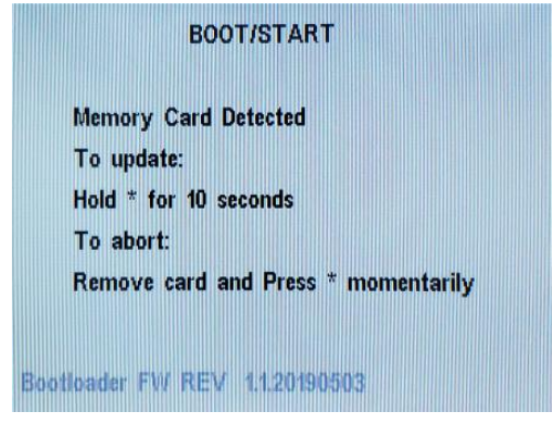
Figure 2. BOOT/START Screen

7. Push the rotary push-button for 10 seconds, until the screen in Figure 3 appears.