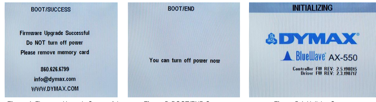
Figure 4. Firmware Upgrade Successful